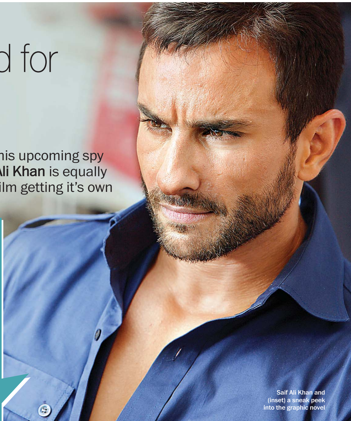
Saif Ali Khan and (inset) a sneak peek into the graphic novel